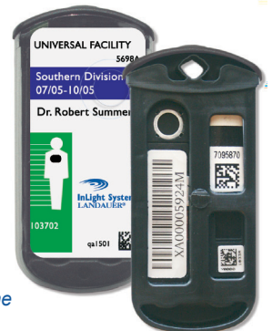
The Neutrak dosimeter can be enclosed inside the InLight holder.