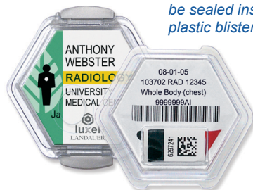
The Neutrak dosimeter can be sealed inside the Luxel+ plastic blister pack.