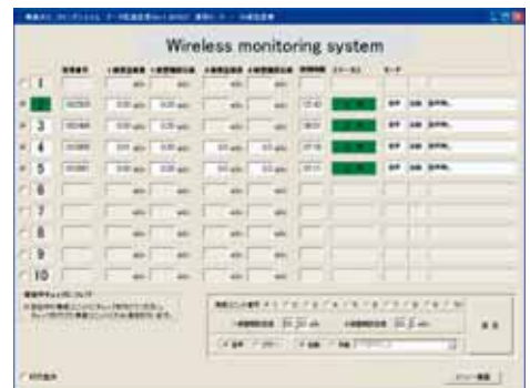
Example display screen of data processing unit