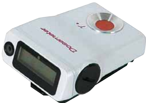
Gamma (X) and beta