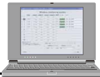
PC (Supply by the User)