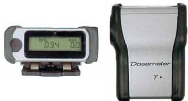
Gamma (X) , Magnesium alloy case