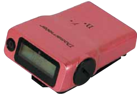
Gamma (X) and neutron